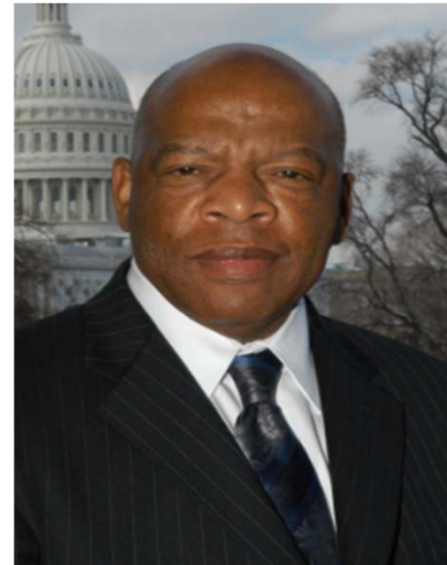
John Lewis U.S. House of Representatives Representing Georgia